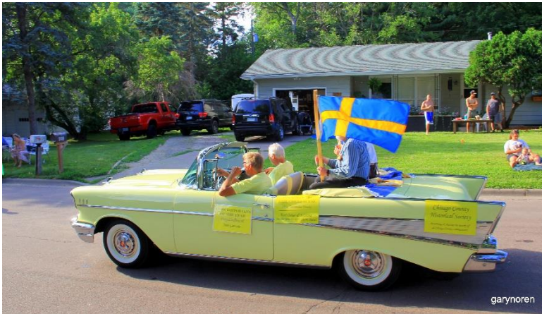
Karl Oskar Days parade