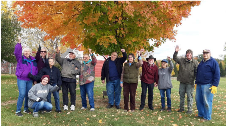
Fall closing 2022